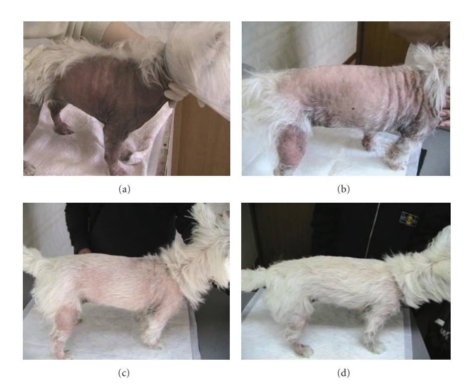
FIGURE 2: Clinical characteristics of Dog 5 at start of the treatment (D0), 6 weeks after D0, and 12 weeks after treatment are shown in Figures 2(a), 2(b), and 2(c), respectively. Progressive changes in disease severity were seen in the 12-week trial period. The dog was treated continuously after the completion of the trial. Clinical symptoms improved 18 weeks after D0 (Figure 2(d)).